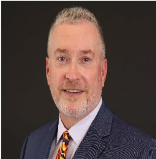
Insert your photo (optional but encouraged.)

“A good leader inspires people to have confidence in the leader; a great leader inspires people to have confidence in themselves. --Eleanor Roosevelt